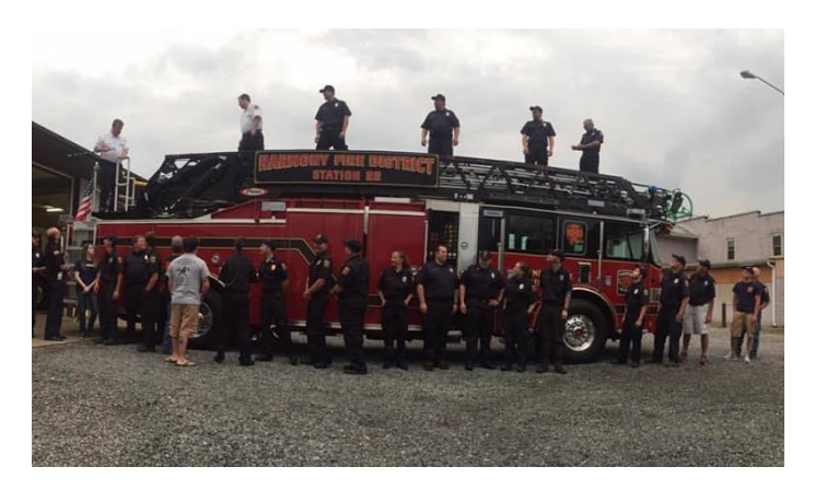
Please see Fire District on page 6